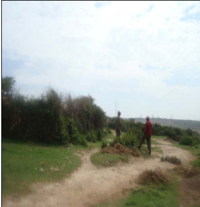
The area to be traversed by the proposed 230 KV Transmission line