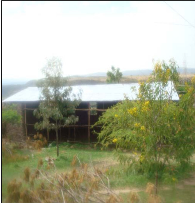
Affected house by new constructed 230 KV Transmission line