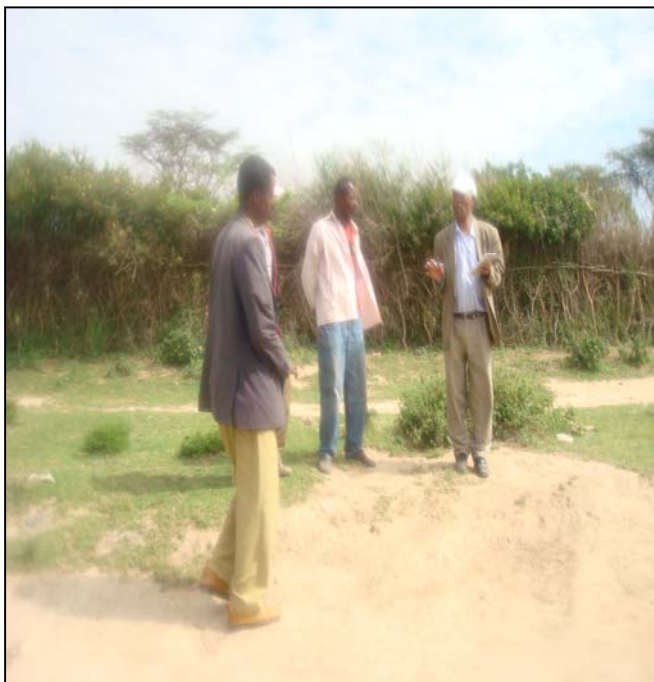
Consultation with a group of affected persons