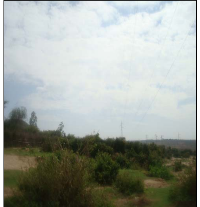
The proposed 230 KV Transmission line will be constructed parallel to this existing line