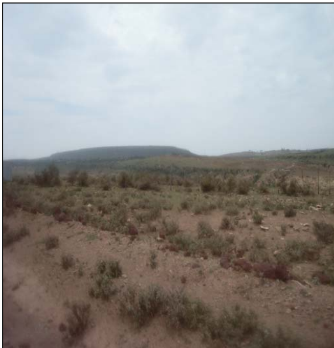
The area to be traversed by the proposed 230 KV Transmission line