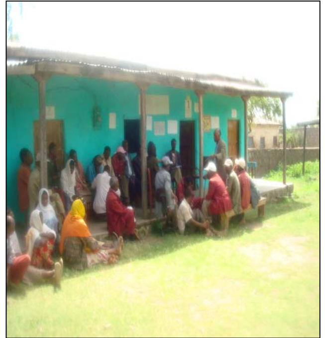
Public consultation at sire robi