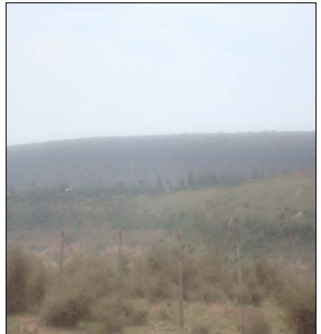
The area to be traversed by the proposed 230 KV Transmission line